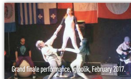
Grand finale performance, Igloolik, February 2017.

Five instructors of the KRG Cirqiniq Program travelled to Igloolik, Nunavut, from February 8 to 20, 2017, where they participated in their third exchange with their Artcirc counterparts. Over the ten days, the two circus troupes shared their passion with young circus enthusiasts, and mostly collaborated to develop a variety of skills and create a public grand finale performance. The exchange represented a great opportunity for Cirqiniq performers to gain valuable experience in specialized facilities. They moreover had a chance to see what it is like to be in a professional performance group like Artcirc.