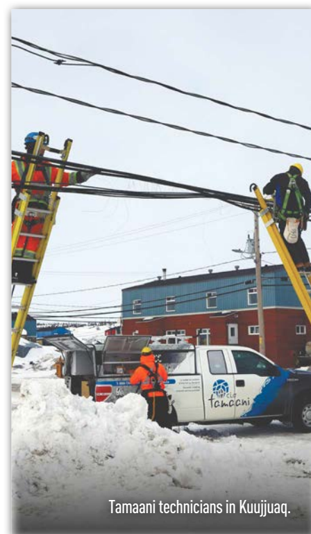
Tamaani technicians in Kuujuaq.

Financing is available for both business start-up and expansion projects and applies to the shipping of equipment and construction materials. Applications must be accompanied by a complete business plan and be submitted to the KRG Regional and Local Development Department in Kuujuaq as early as possible, and no later than May 5, 2017, for the last fall sealift.