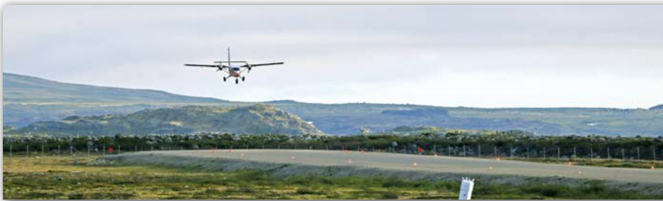
Runway resurfacing will be accomplished in several communities in 2017.

At the May sitting of the KRG Council in Umiujaq, the Ministère des Transports du Québec (transportation, MTQ) presented an overview of recent, in progress and upcoming projects related to regional airport infrastructure.