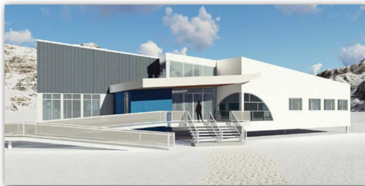
Future municipal office of the Northern Village of Kangiqsujuaq.

The MPW Department will also supervise complete renovations of childcare centres in Kuujuaq, Kuujuaapik and Inukjuak. The work is in part necessary to renovate and modernize the buildings. The KRG is financing these projects through the childcare program.