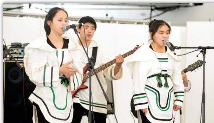
TNQ cultural performers at the 2016 AWG in Nuuk, Greenland.

Finally, coaches and chaperones play an important role contributing to the success of TNQ athletes and cultural performers. From the beginning of January to the end of May, TNQ and the Recreation Department conducted a call for candidates interested in coaching during preparations, training and participation of TNQ at the 2018 Arctic Winter Games. The application period has been extended to September 1 st for Arctic Sports (male) and Badminton (female).