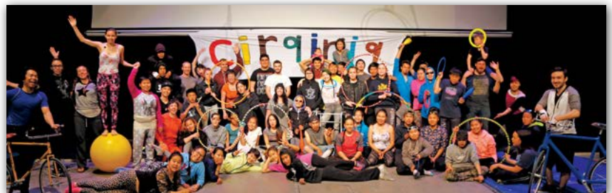
Group photo of this year's Cirqiniq Summer Camp participants in Kuujjuaq.