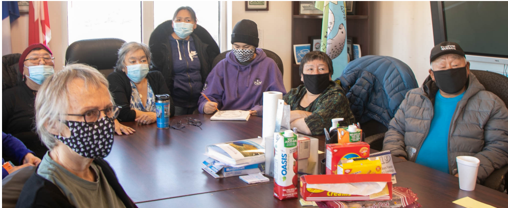
Members of the Artists Association in Ivujivik discuss the need for a new arts centre to serve artists throughout Nunavik.

The Nunavik Social Economy Roundtable also hosted an Acknowledgement Award that recognizes the efforts invested in their work by an employee on a daily basis. Next year's Social Economy campaign intends on being even more promising.