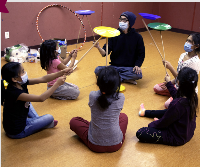
◀ Cirqiniq workshop in Kuujjuaq, October 2020.

Cirqiniq aims at giving youth a chance to express themselves, exercise their creativity, explore their boundaries and develop their self-esteem. Participants were able to reach these goals by strictly following the protection measures.