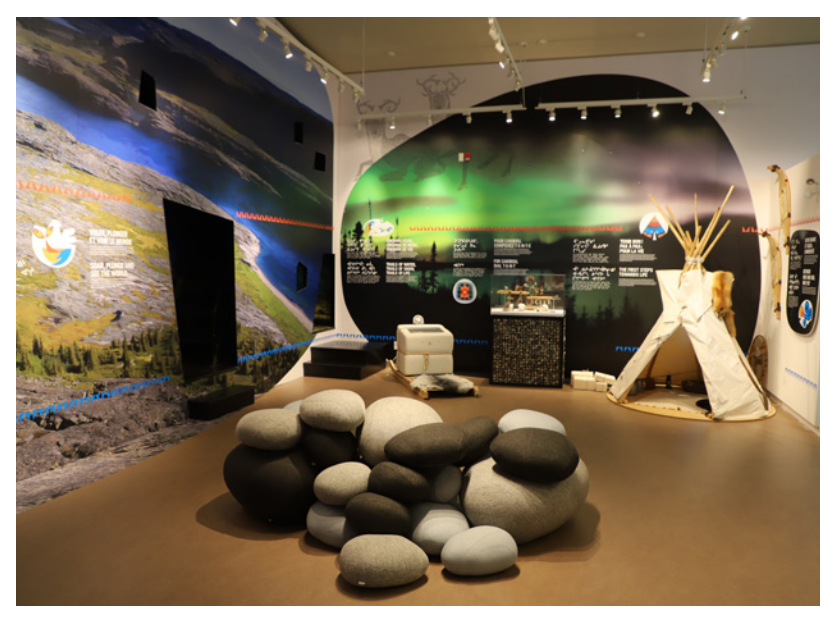
The Interpretation Center of the Tursujuq National Park. Guests can now visit the interpretations centers by contacting Nunavik Parks.

Nunavik Parks had postponed implementing its new 3-year strategic plan until 2022. However, Nunavik Parks will continue, as much as possible, to operate this year by offering activities in parks for local communities by fully respecting the public health guidelines.