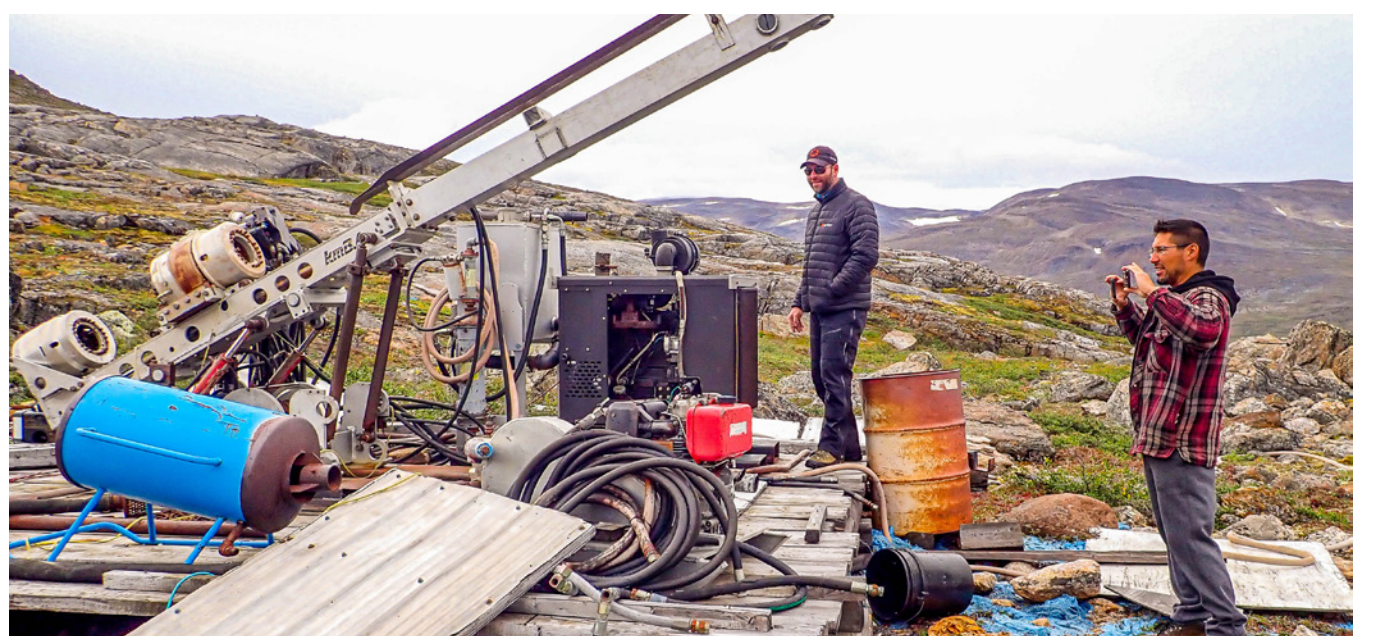
An abandoned mining exploration site north of Kangiqsualujjuaq near the Abloviaq Fjord.

In Kuujjuaq, these projects created 4 jobs for 2 weeks during the summer of 2020. As for Kangigsualujjuag, these same initiatives produced 5 jobs for a week over the summer of 2020, and 10 jobs for a week over the winter of 2020.